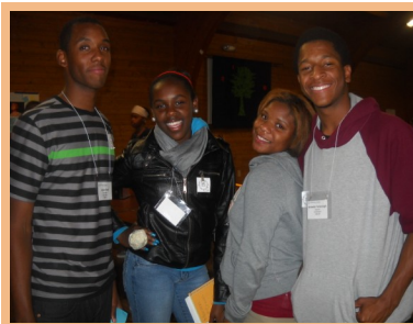
Students at the 2011 Fall High School Retreat